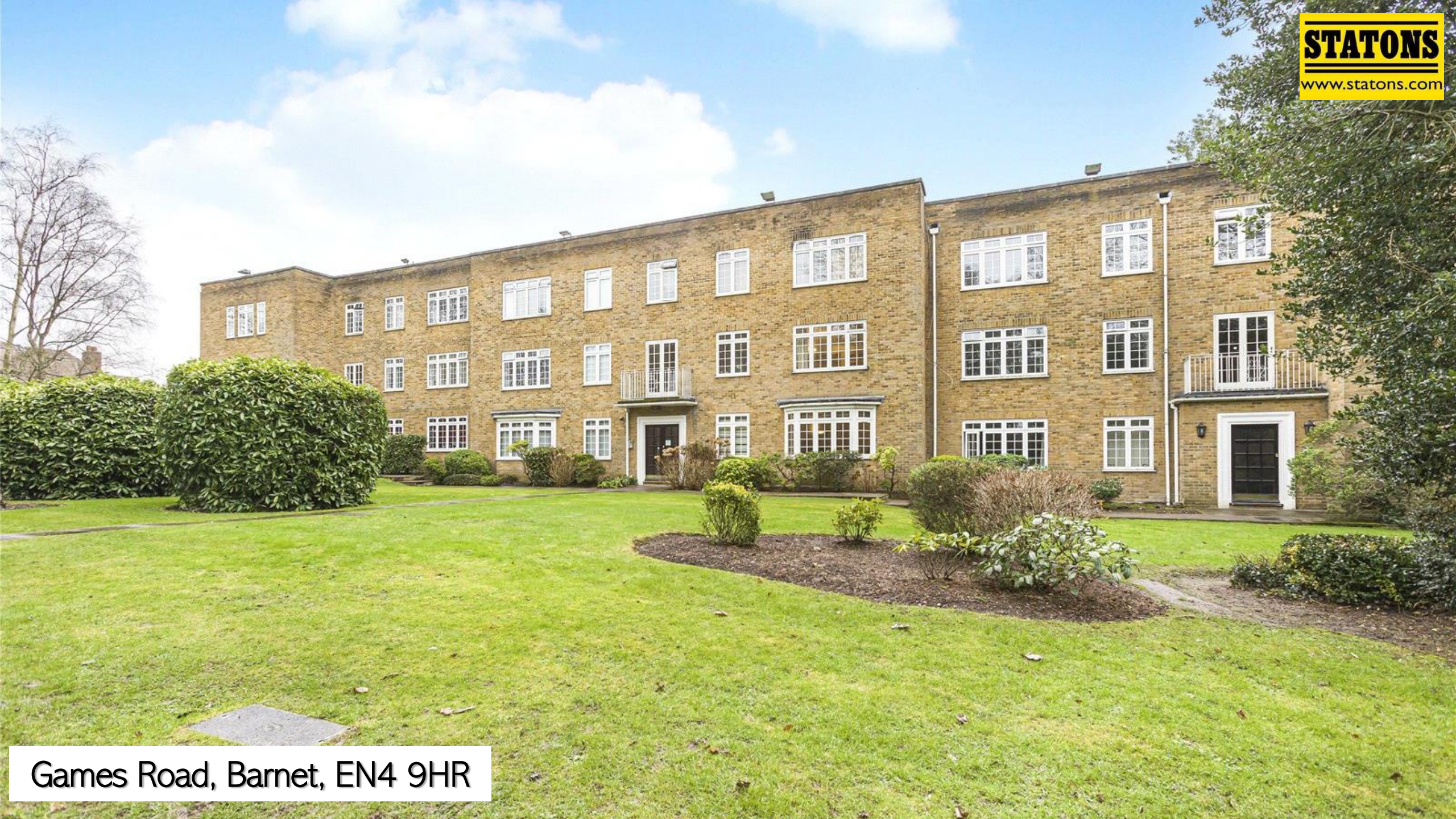
Games Road, Barnet, EN4 9HR