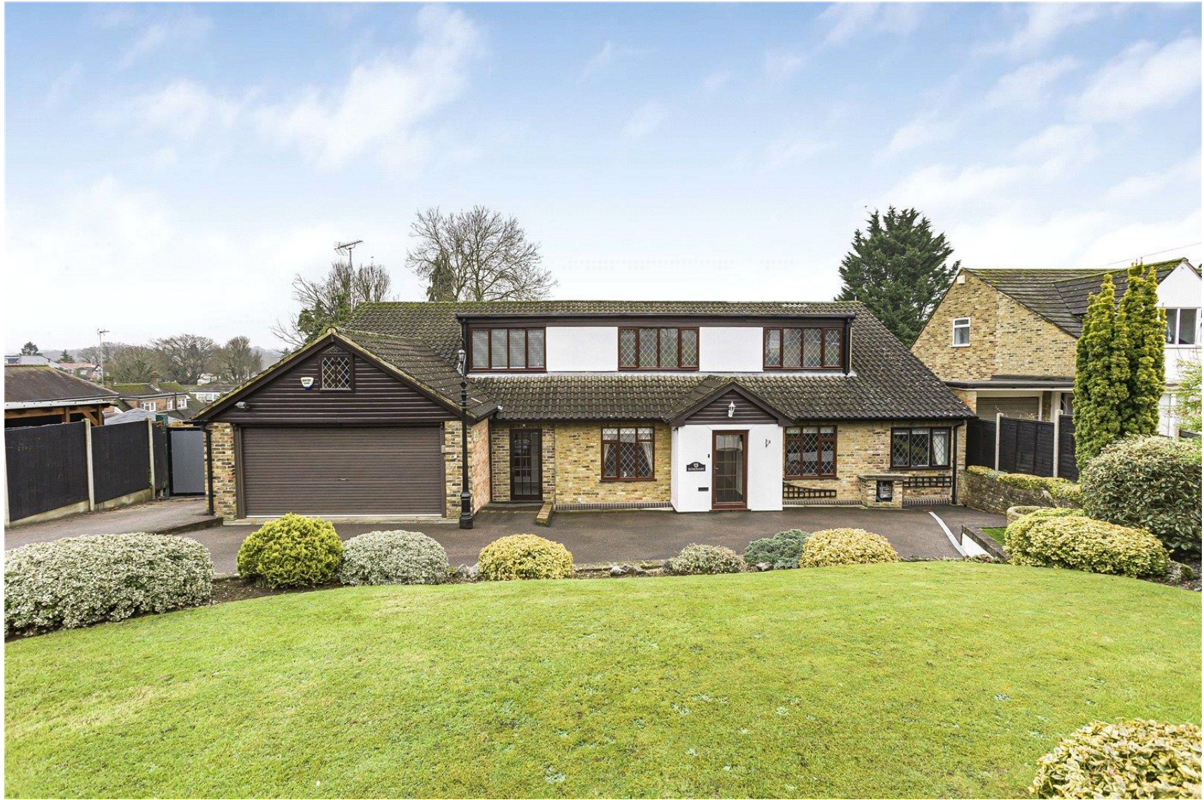
Tetherdown Orchard Close, Cuffley EN6 4QD