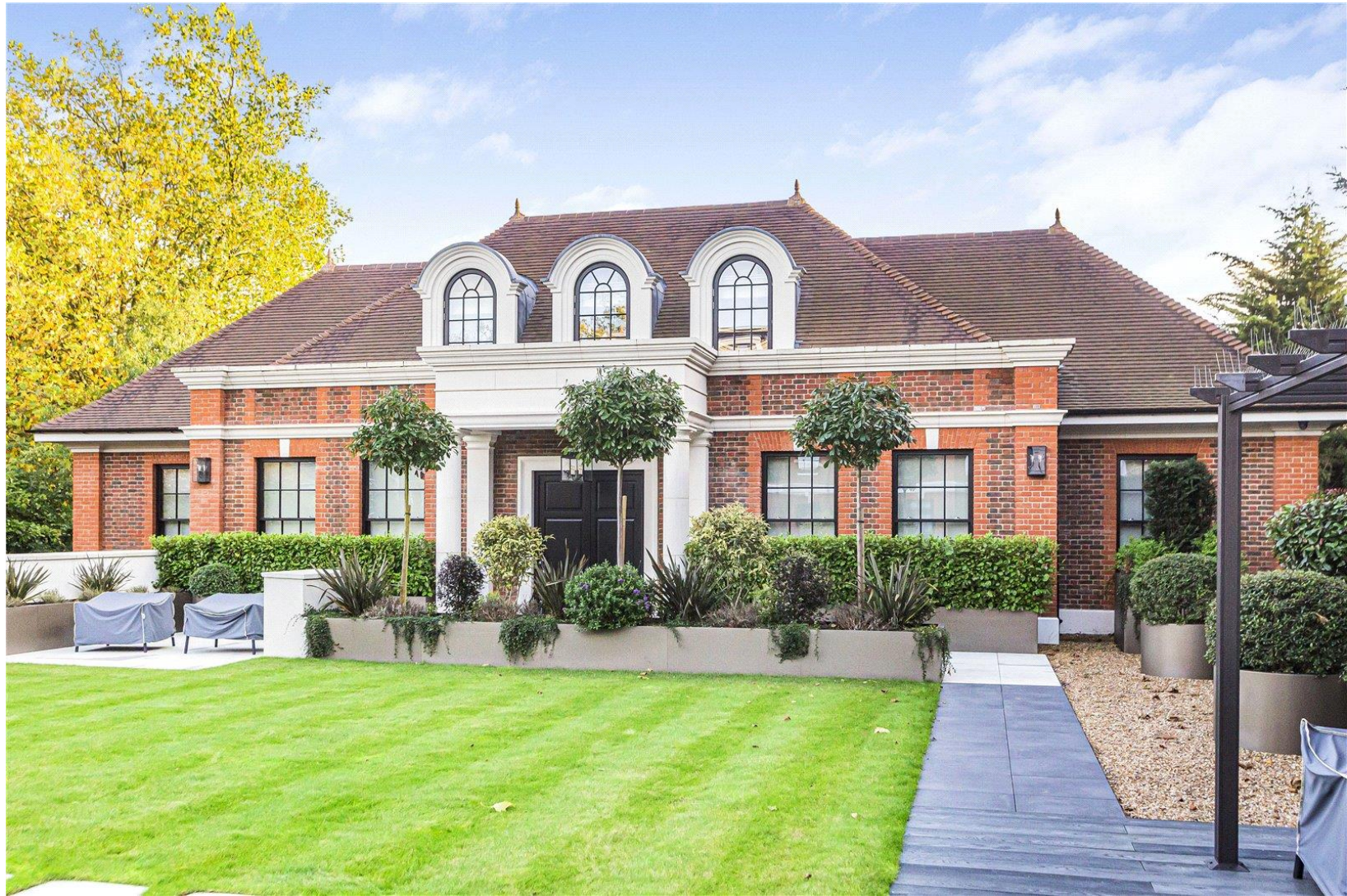
Beech Hill Hadley Wood, EN4 0JP