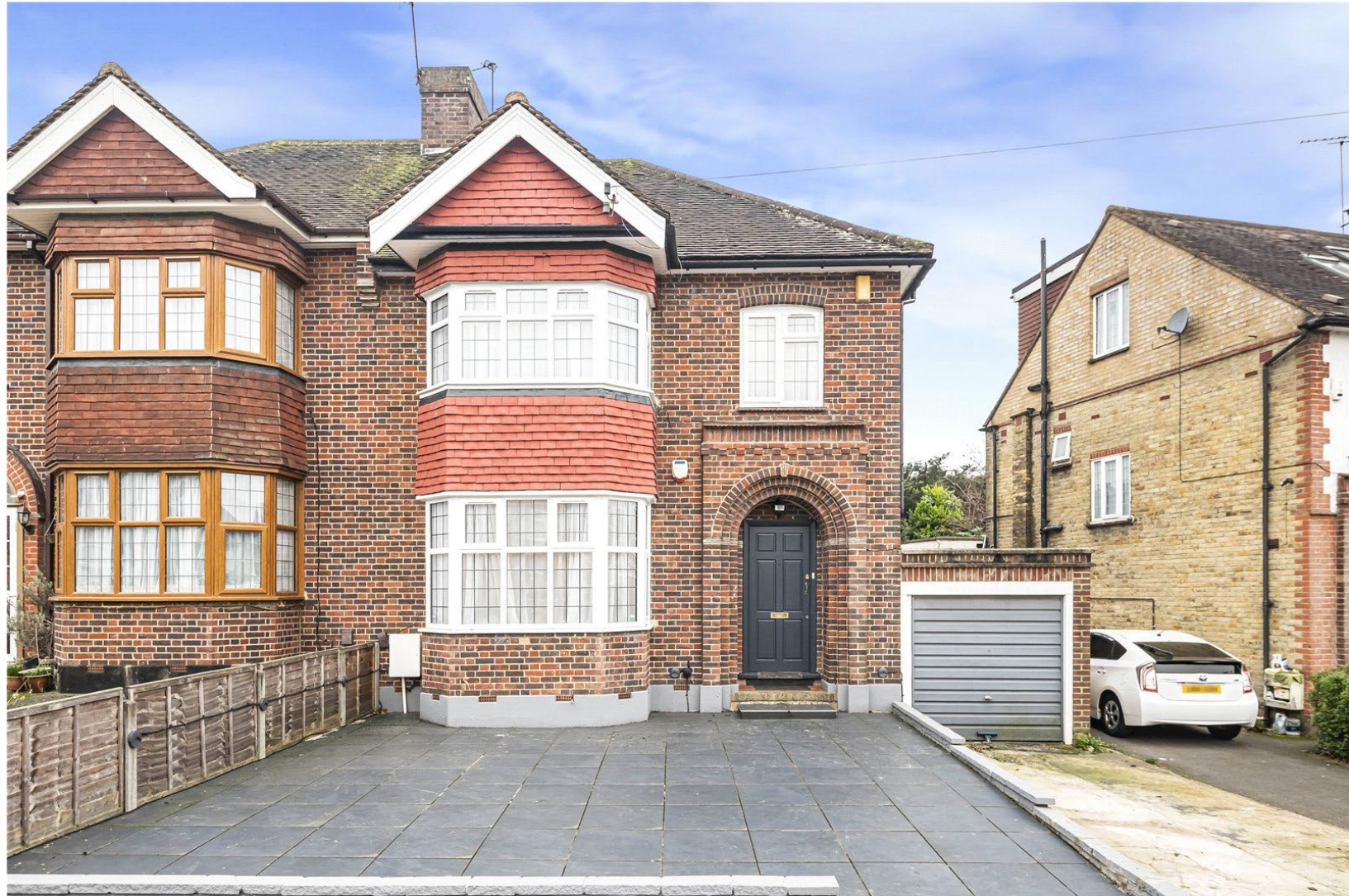
CISSBURY RING NORTH, London, N12 7AL