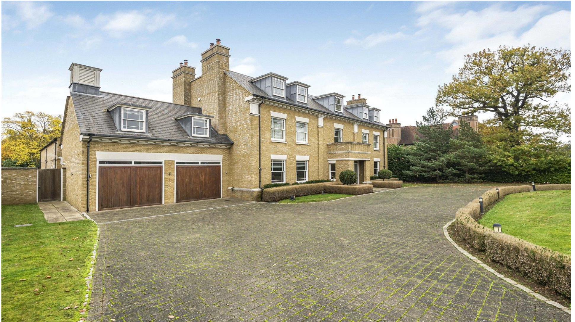
Broad Walk London, N21 3DA