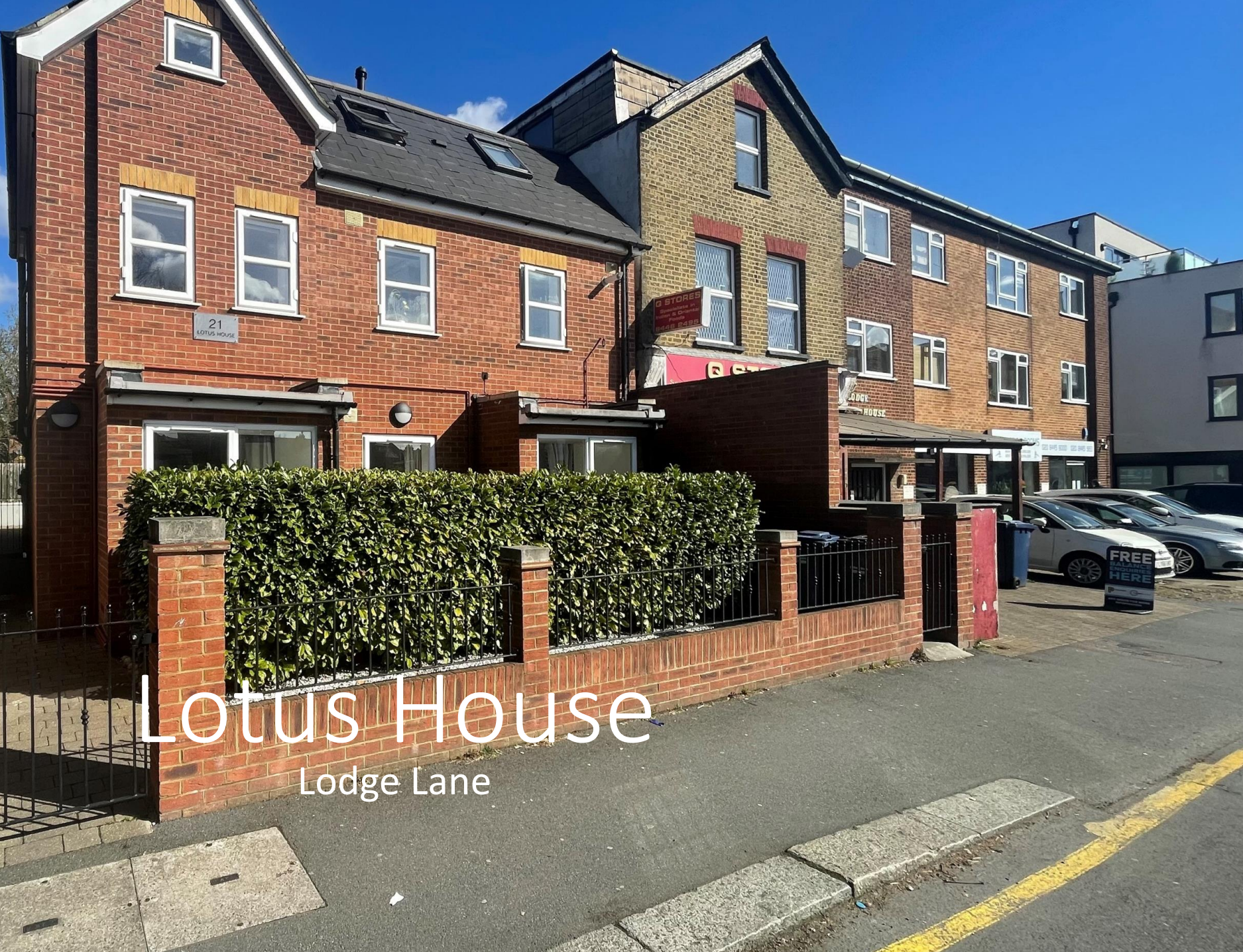
Lotus House Lodge Lane