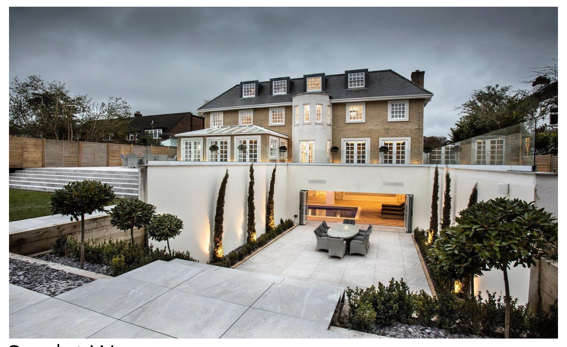
Camlet Way, Hadley Wood, Hertfordshire, EN4 OLH